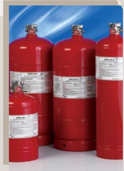
Kidde IND™ System

The Kidde IND System is available in two basic configurations: as a local application system or a total flood system. A local application system is designed to protect a specific piece of equipment, a total flood system is recommended for protection of enclosed rooms or spaces. In addition to the configurations, the Kidde IND System also offers options for detection and control to create a system that will be ideal for your application. Your Kidde Distributor can help you design the right system, and the right approach, for your application.