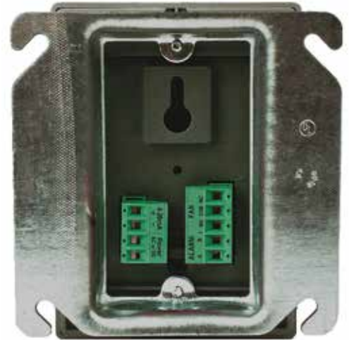
GD-6 Rear View