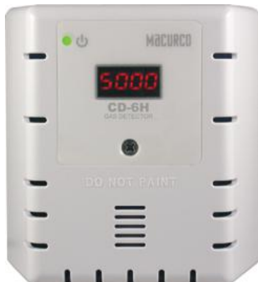
White Housing Option

The Macurco 6 & 12 Series fixed gas detectors provide life-saving solutions aimed to protect people and property. These fixed gas detectors are designed for low level detection, mitigation, and notification. Let these detectors do the work for you by shutting off valves, turning on fans, engaging horns and strobes, and provide notification to fire panels and building automation systems when gases reach key limits.