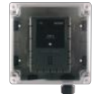
Weatherproof Housing Kit (Detector sold separately)