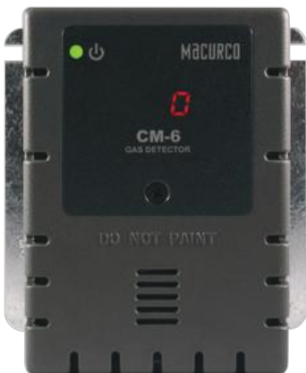
Grey Housing (Standard)